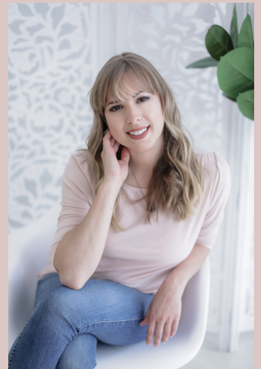
White wooden lacy backdrop