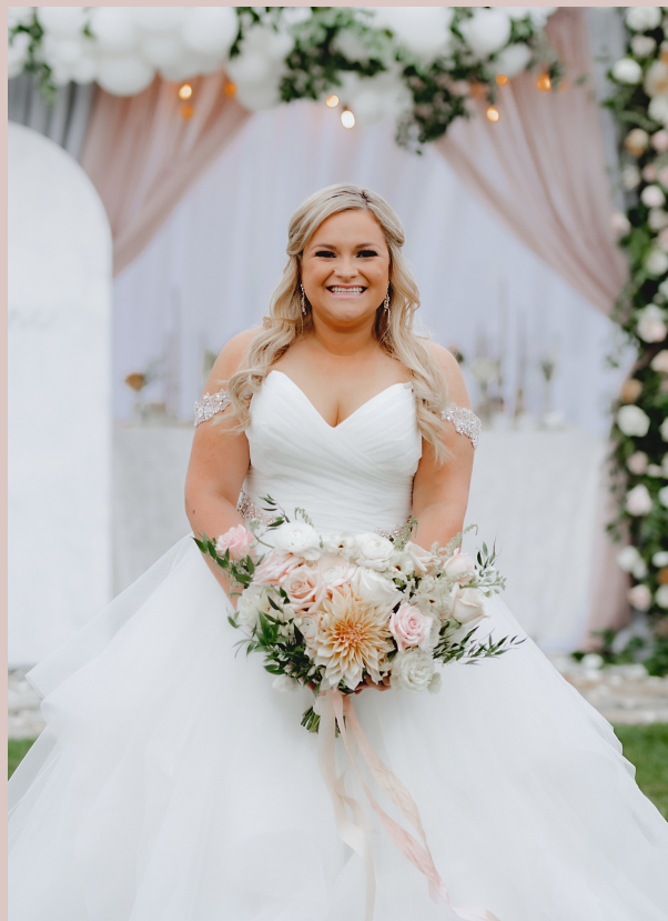
for my 10th Anniversary Wedding Celebration